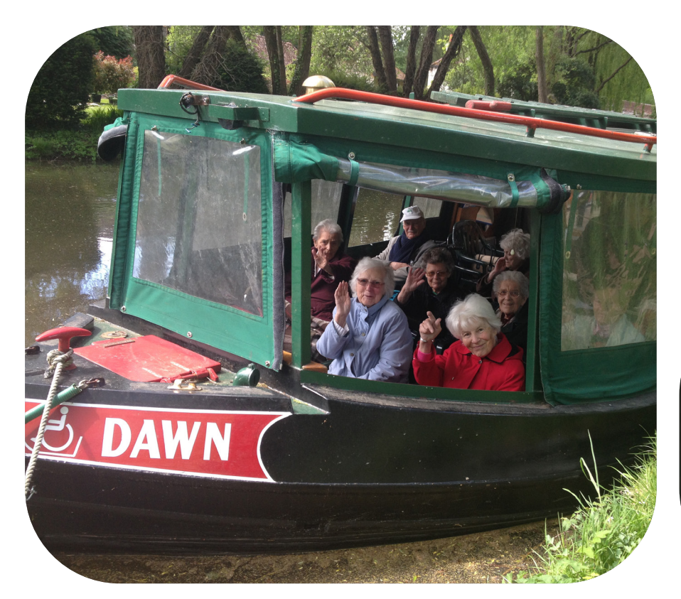
One of our residents favorite summer activities, a trip along the canal