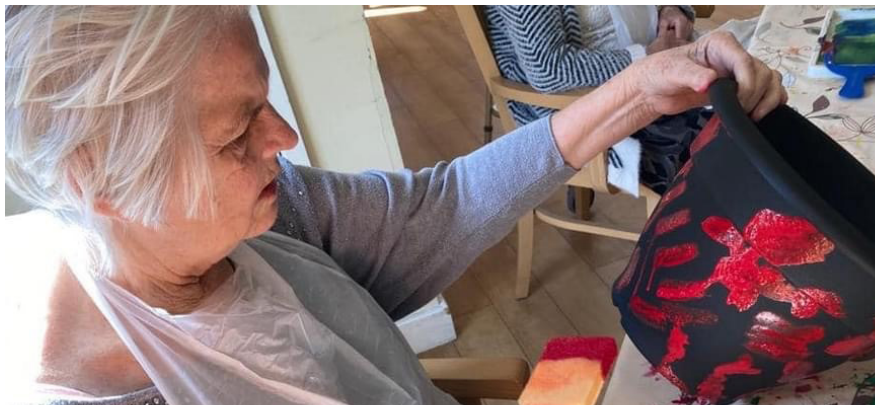
Plant pot making