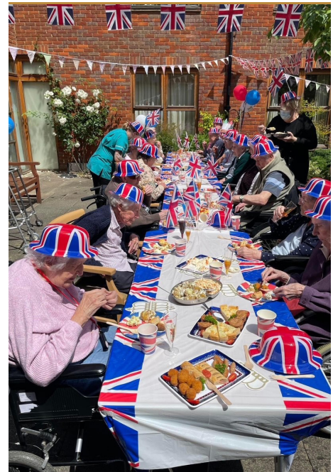
Jubilee street parties