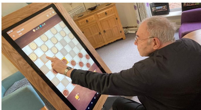
Board games on the virtual table