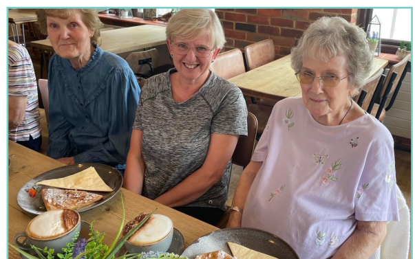
Trip out to the Plucky Pheasant