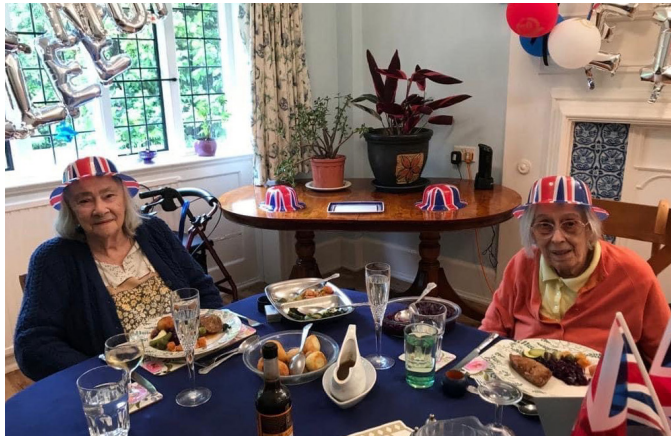
Celebration luncheon at Kemnal