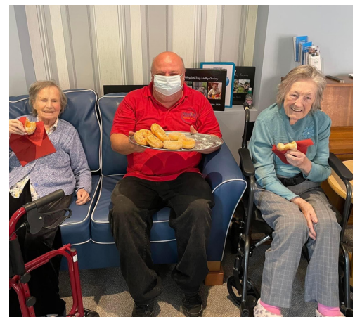
National Doughnut week