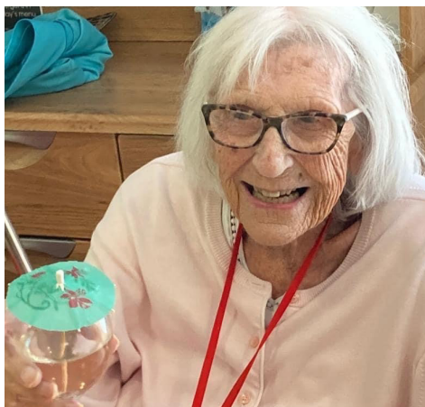
Mocktails - chin chin !