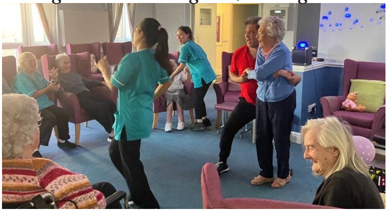
Party time at Nower House.

Getting out and about together, creating new memories