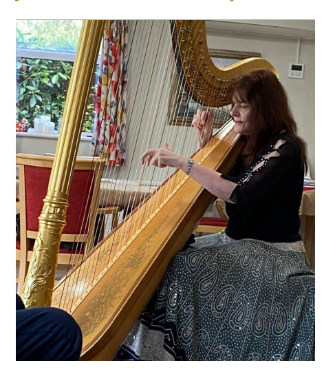
Beautiful sounds at Ridgway.