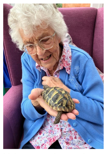
Livingstone the tortoise.