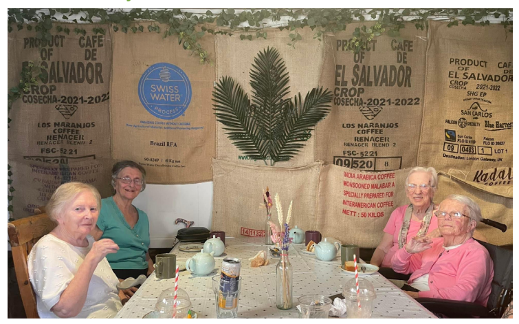
Trip to Berkshire Herb Farm.